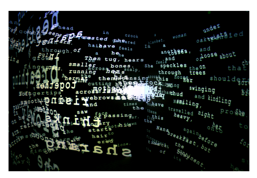
Figs. 3-4. The texts of Screen are projected onto three walls (top). In increasing speed, words are separating from the walls (bottom).