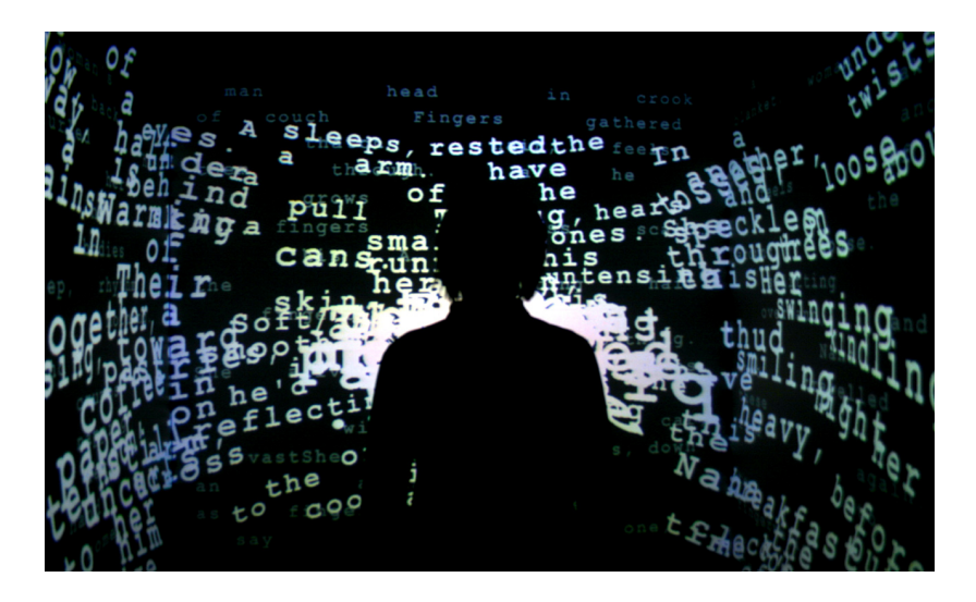
Fig. 5. Finally, the words are collapsing into the center of the Cave.

In a media-technologically quite specific way this oscillation between what is said—that itself is changing (and indeed depending on the interactivity made possible by the media dispositive)—and that which is made to appear in the imagination of the recipient is only stopped when the texts in the Cave finally collapse, i.e., when the basically unlimited semioses are broken off. On the basis of the actions of the recipients, a changed text is building up on the projection walls and with this also a changed memory is retained. Finally, the following text is read aloud: